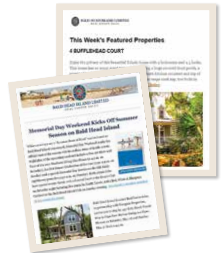
FREQUENT EMAIL NEWSLETTERS