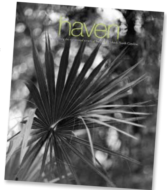
40,000 COPIES OF HAVEN MAGAZINE ARE DISTRIBUTED ANNUALLY.

Of course, our most important assets are our experienced and professional sales team members, who are dedicated to connecting buyers and sellers, and serving all parties long after the sale. Nearly one-third of our sales can be attributed to referrals and word-of-mouth. We'd love the opportunity to understand your individual goals and time table, and see how we can work to facilitate the sale of your island property.