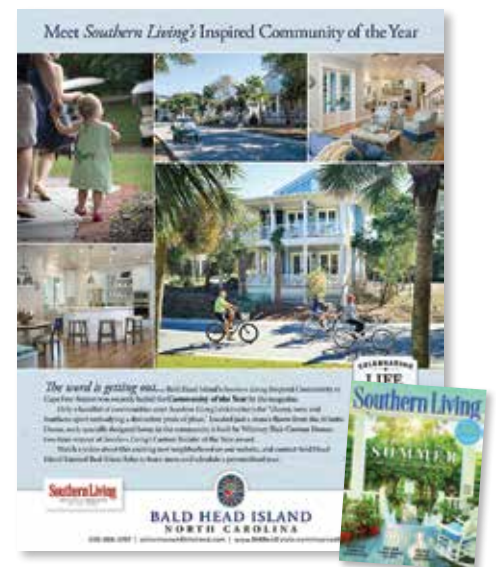
NATIONAL AND REGIONAL ADS IN TARGETED PUBLICATIONS PROMOTE ISLAND VISITATION AND AWARENESS OF REAL ESTATE.